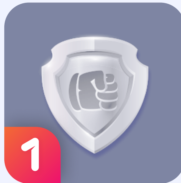
Left - Bottom