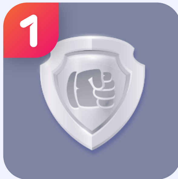
Left - Top