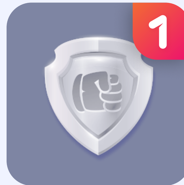
Right - Top