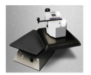
Example from http://geoknight.com/